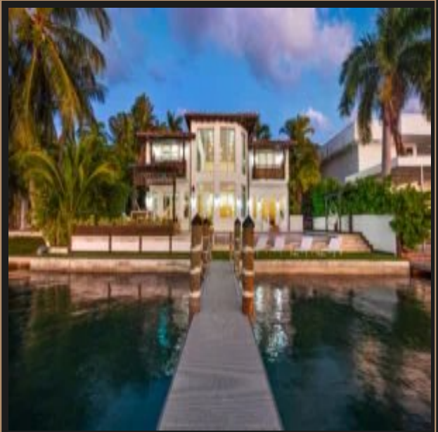
VILLA MILTON (5)