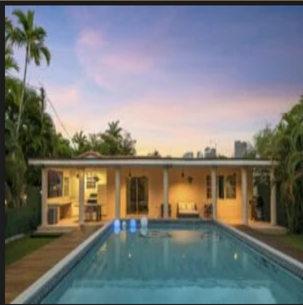
VILLA HEAT (4)