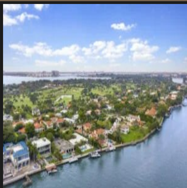
VILLA LEBRON (5)