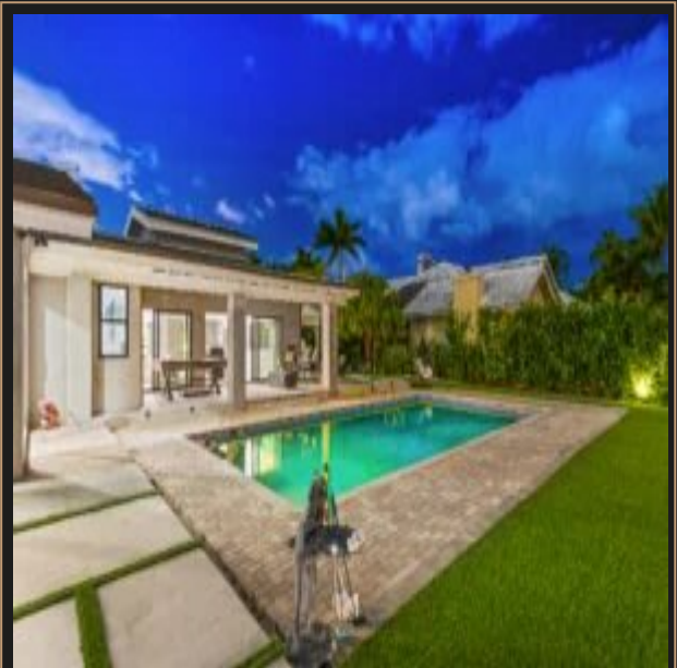
VILLA VOGUE (5)