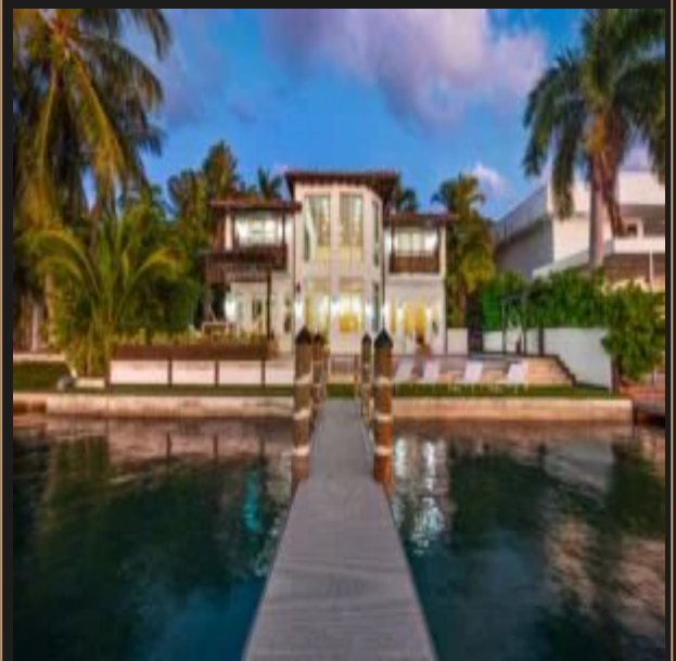
VILLA MILTON (5)